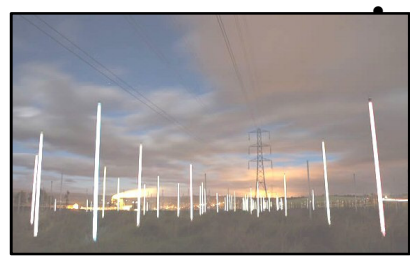
Fluorescent tubes being lit by the electric field